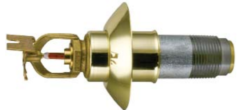
SLEEVE & SKIRT