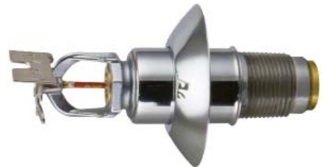
SLEEVE & SKIRT