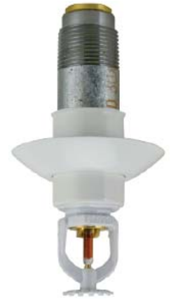
SLEEVE & SKIRT