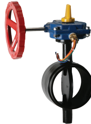
Fireriser® Model: HPG1C